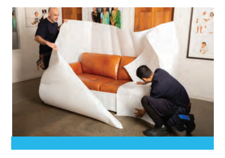
International wrap - Leather Settees