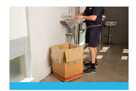
Bubble carton with 'air pillow' technology