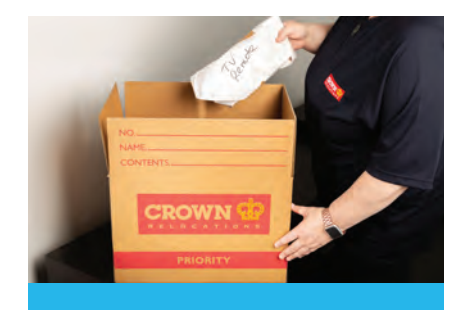
Priority Box or screws, remotes and important little things