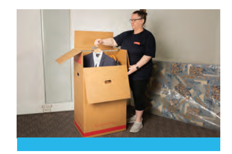
Porta Robe Carton