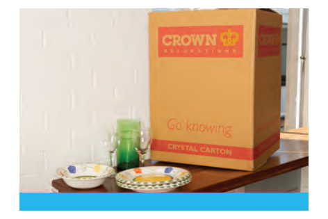
Crown Crystal carton with reinforced extra thickness