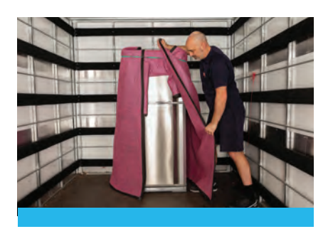
Double pads for whiteware / stainless / leather settees