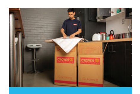
Dish Pack Carton