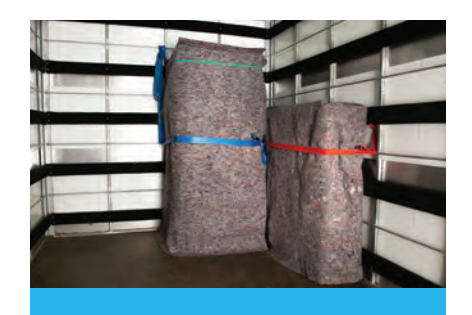
Standard Furniture Pads