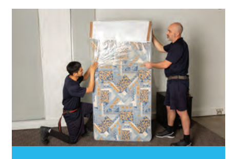
Plastic wrap and capped for beds, upholstered settees