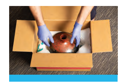
i-Foam carton with 'foam moulding' technology