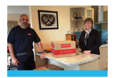
'Giving Back' Carton